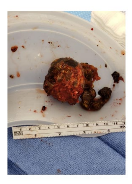
FIGURE. 2: Gross surgical specimen of the peripherally calcified gallstone that had passed through the cholecystodoudenal fistula into the proximal doudenum.