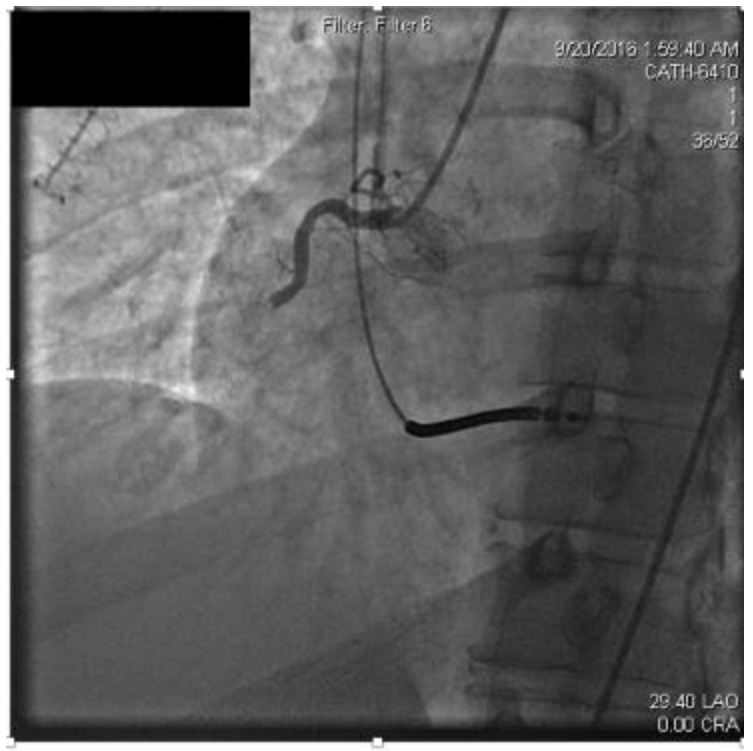
Figure 2a. Acute thrombosis within the proximal right coronary artery.

Anticoagulation was continued with weight based boluses of heparin to achieve an activated clotting time (ACT) of ≥250. Percutaneous intervention was attempted with suction thrombectomy, balloon angioplasty, and drug-eluting stent delivery through the mid to distal right coronary artery. Three everolimus-eluting stents were deployed in overlapping fashion and dilated to nominal atmospheres. Stent apposition was then interrogated with intravascular ultrasound (IVUS), and each stent was determined to be appropriately deployed after post-dilation to high atmospheres (16-18 atm). Following this, coronary occlusion persisted, but he was free of chest discomfort and remained hemodynamically and electrically stable (Figure 2b).