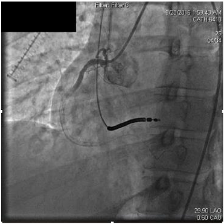
Figure 2b. Persistent coronary thrombosis following attempted percutaneous coronary intervention

Due to concerns for contrast exposure with acute renal failure and lack of perceived benefit to the patient, attempted revascularization was abandoned and he was transferred to the intensive care unit for close monitoring. Dual antiplatelet therapy was continued as before with aspirin 81mg and ticagrelor 90mg twice daily. In the following 24 hours, however, he experienced recurrent angina and was taken back to the catheterization laboratory. Remarkably, the previously occluded RCA appeared recanalized but with thrombus apparent at the distal stent edge at the ostium of the right posterolateral branch (Figure 3a).