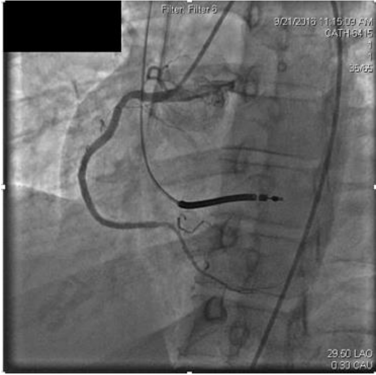
Figure 3a. On repeat right coronary angiography for acute, acute thrombosis is seen within the distal right coronary stent.

Slow injection of intracoronary abciximab (14mg over multiple injections) was administered with resolution of the thrombus and ischemic symptoms (Figure 3b).