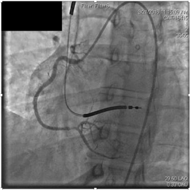
Figure 3b. After recanalization of the distal right coronary stent, the occluded right posterolateral branch is visualized.

The patient was then loaded orally with a reduced dose of prasugrel 30mg, and IV abciximab was continued post-procedure after returning to the intensive care unit. A reduced loading dose of prasugrel 30mg was chosen due to concerns for bleeding, having previously received ticagrelor, heparin, and abciximab. Left ventricular (LV) function assessment by echocardiogram later revealed severely reduced LV function with anteroseptal and apical akinesis with an estimated ejection fraction of 25%.